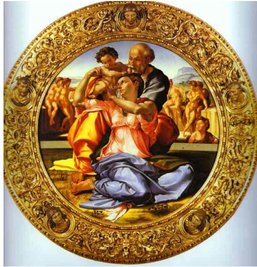
Michelangelo's The Holy Family with St. John the Baptist