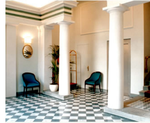
Lobby, Hotel Carolus