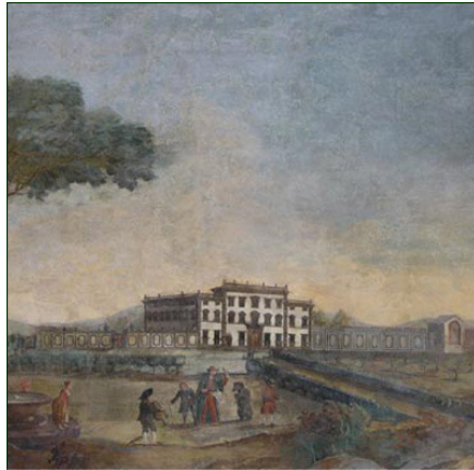
Fresco of La Pietra - Acton Collection